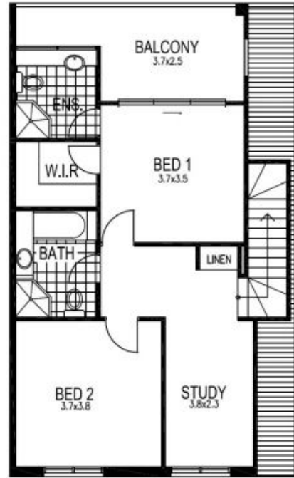
UPPER FLOOR DWELLING 4