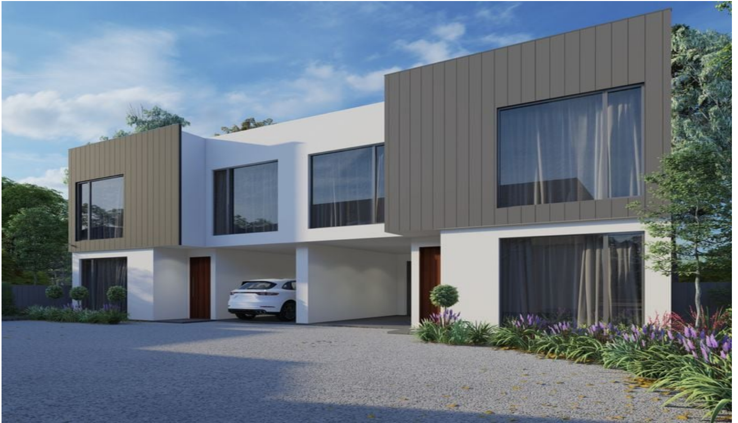
esworth Park 500 metres away