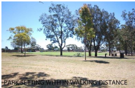
PARK SETTING WITH IN WALKING DISTANCE