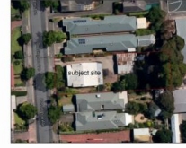
locality plan scale: nbs